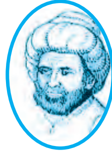
Muhammad ibn Musa al-Khwarizmi (C.E. 780 – 850)

A lemma is a proven statement used for proving another statement.