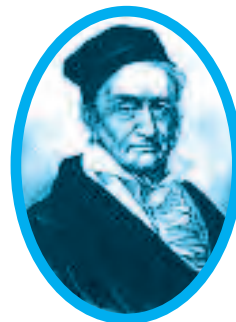
Carl Friedrich Gauss (1777 – 1855)

Carl Friedrich Gauss is often referred to as the 'Prince of Mathematicians' and is considered one of the three greatest mathematicians of all time, along with Archimedes and Newton. He has made fundamental contributions to both mathematics and science.